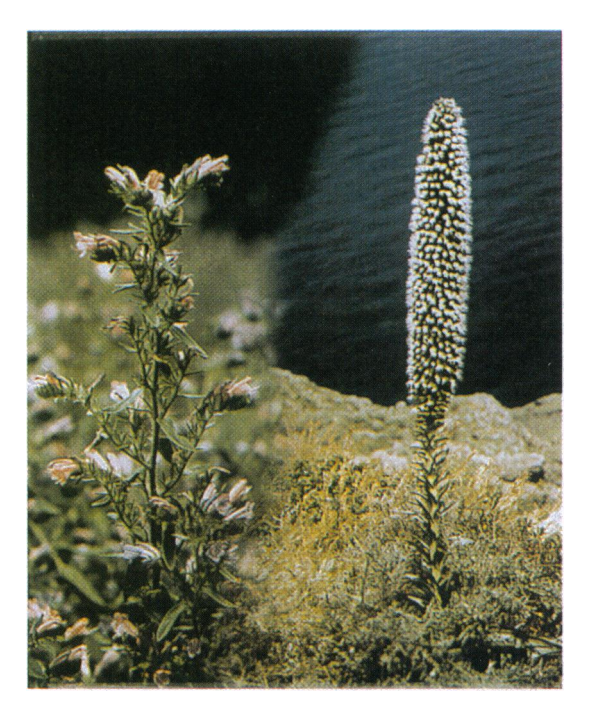
FIG. 1. Echium creticum (Left) and Echium simplex (Right), representatives of the herbaceous continental and woody island species, respectively, found in this genus of circummediterranean and Macaronesian (Canary, Madeira, and Cape Verde archipelagos) distribution. E. creticum is annual to biennial, whereas E. simplex, an endemic of the Anaga mountains (Tenerife), is a monocarpic rosette tree—i.e., forms a perennial vegetative rosette and flowers only once in life, producing several thousand propagules and dies.