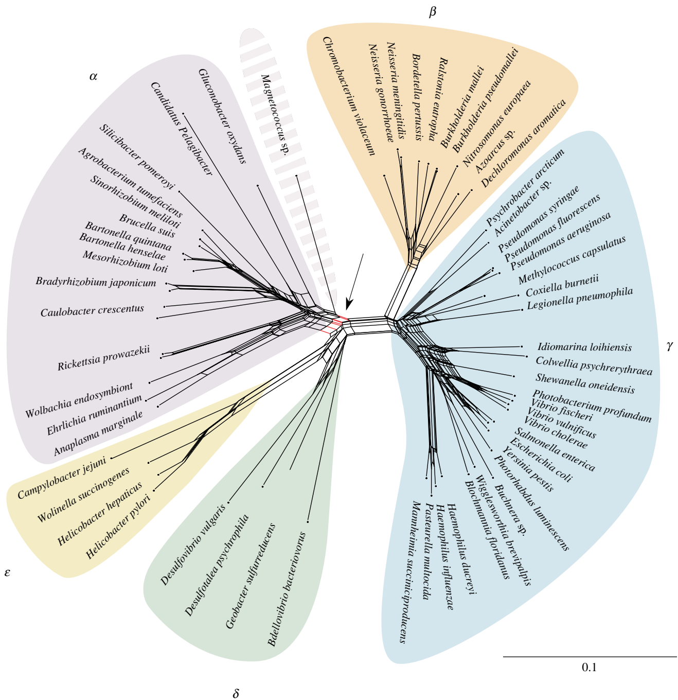
Figure 2. Neighbour-Net (Huson & Bryant 2006) of proteobacterial 16S rRNA. The bootstrap support for the split of Magnetococcus with \alpha -proteobacteria (highlighted in red and with arrow) is 73% using neighbour-joining, 61% using Neighbour-Net and 45% using maximum likelihood (see electronic supplementary material).